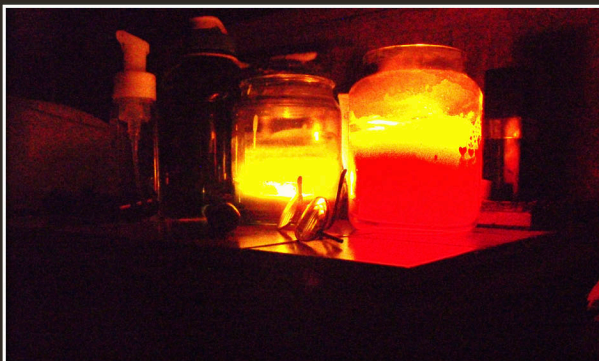
Judith Mazzucco The Essentials: My Glasses, Light and Perfume , Nov. 5, 2012, digital photograph

Reception Tuesday October 15, 5:30-7:30pm